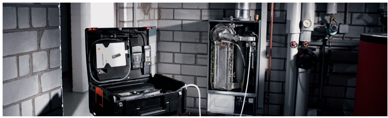
Automatic servicability test with gas-feed appliance with connection to the gas boiler