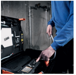
Automatic tightness test