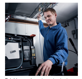
Drinking and waste water test with high-pressure probe up to 25 bar